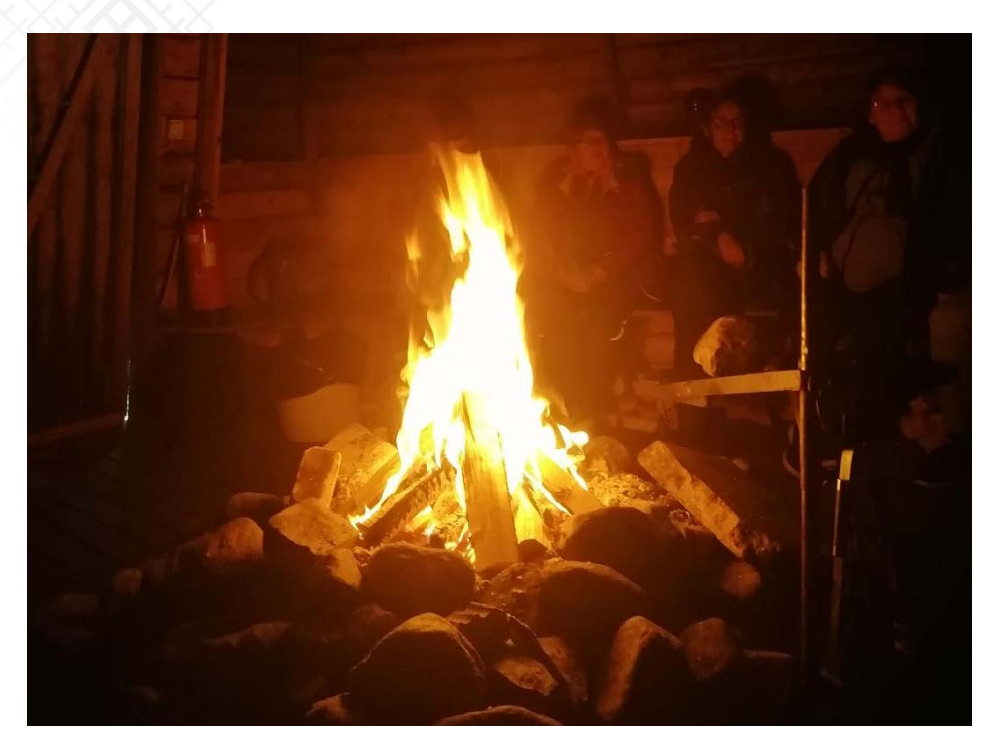
Figure 3. Talanoa conversations around the fire in Gilbbesjávri/Kilpisjärvi.

meaning (Fig. 3). It is a common way of knowing and speaking from the heart. Po-talanoa : dialogues in the night. Mafana : the warmth in the research.